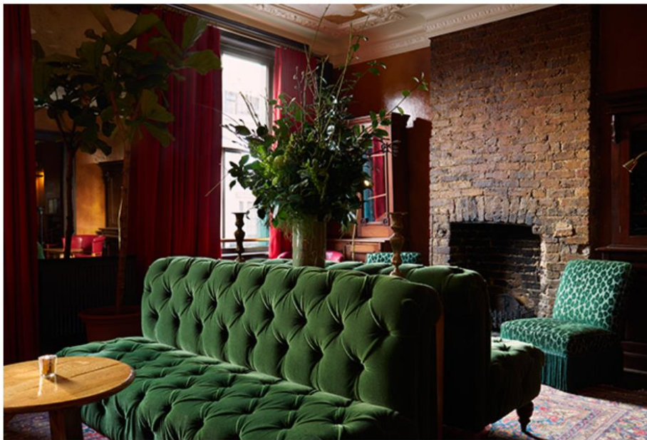
The Walmer Castle