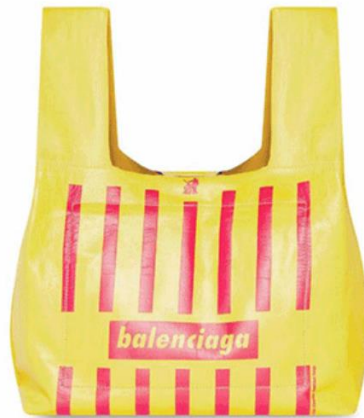
Supermercado By Balenciaga

First it was an expensive IKEA-style bag, and now Balenciaga have gone on to upgrade Tesco plastics and the McDonalds happy meal with their Monday Shopper totes. They're reusable, made out of extremely soft leather, and more fun than an upgraded bin bag.