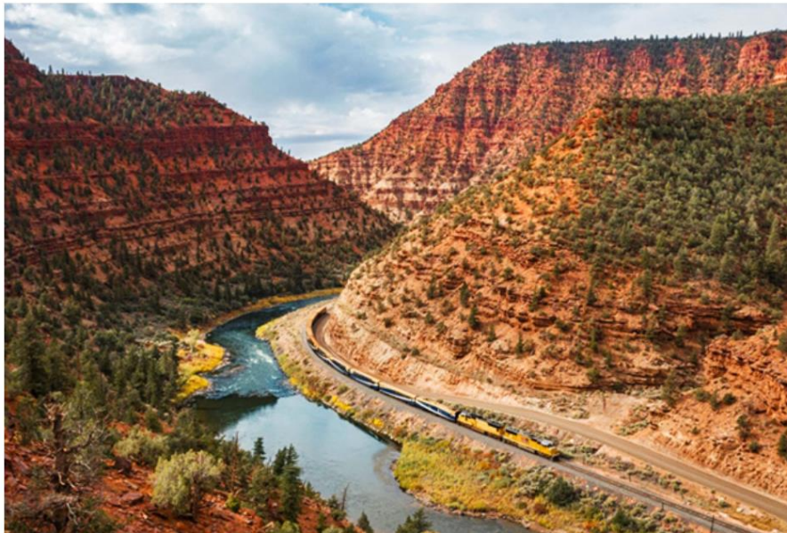
Rocky Mountaineer New route