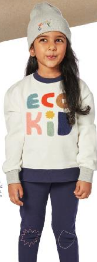
Mon Coeur Eco-kid sweatshirt spun from reclaimed and recycled fibers, $69, moncoeur.com