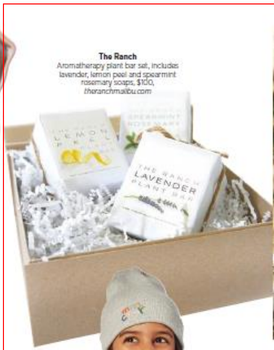
The Ranch Aromatherapy plant bar set, includes lavender, lemon peel and spearmint rosemary soaps, $100, theranchmalibu.com