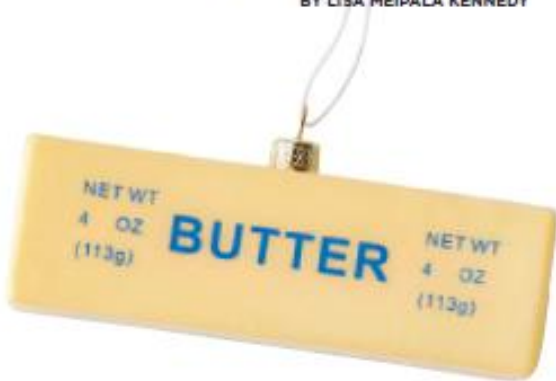
Cody Foster Vintage-inspired food ornaments, starting at $16, food52.com