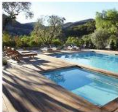
CLOCKWISE FROM LEFT: A hike in the Santa Monica Mountains; An outdoor meal at The Ranch at Live Oak; The pool at The Ranch.