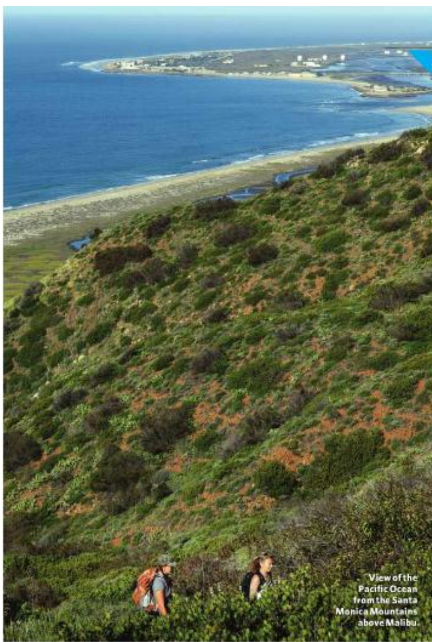
View of the Pacific Ocean from the Santa Monica Mountains above Malibu.

gorgeous shelter magazine-styled casitas. I unpack and meet my 17 fellow “campers,” aged from early 20s to late 60s, who have shelled out several thousand dollars for a week of recalibration.