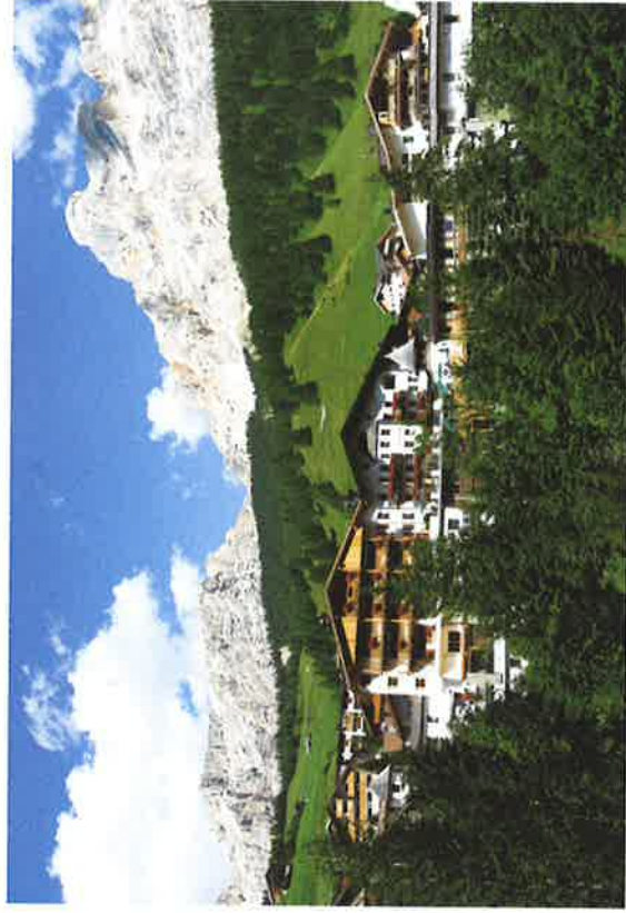
From top: The beguiling landscape of the Dolomites; the Rosa Alpina hotel

$8,500 for seven-day program, inquiry@theranchmalibu.com , theranchmalibu.com